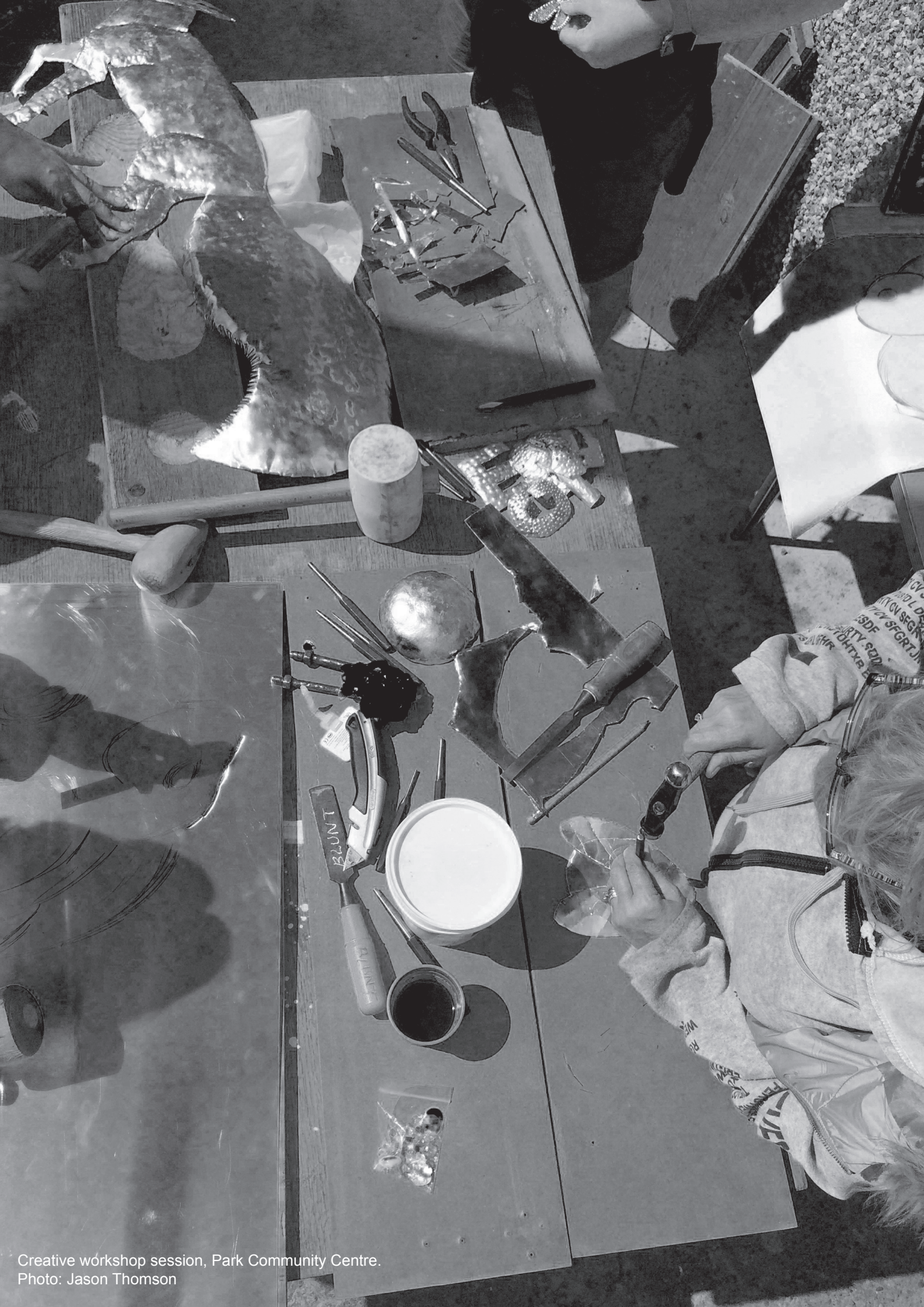
Creative workshop session, Park Community Centre.