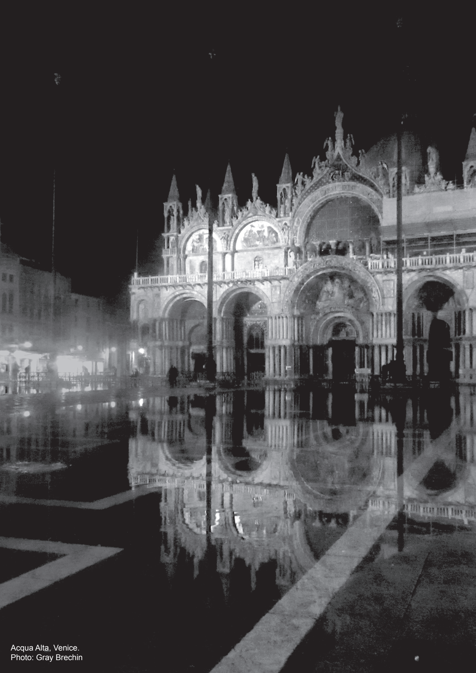
Acqua Alta, Venice.