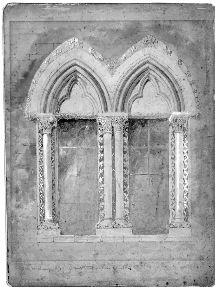
Ruskin's design for a window of the Oxford Museum, c. Birmingham Museum & Art Gallery

In 1855, Oxford University set about building its first science faculty. The Oxford Museum was to be an experiment in scientific architecture, combining the beauty of medieval Gothic with modern industrial materials, and setting in stone a vision of the natural world revealed by science.