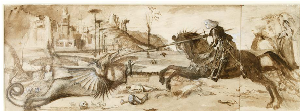
John Ruskin Study from Carpaccio's St George and the Dragon, in Venice's Scuola degli Schiavoni (1872).

2019 sees two exhibitions to celebrate Ruskin's bicentenary: The Power of Seeing , to be shown at Two Temple Place in London and Art & Wonder at the Millennium Gallery in Sheffield.