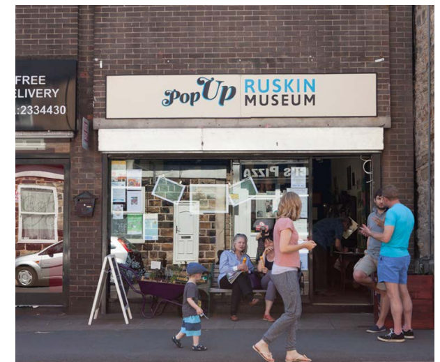
The award-winning Pop-up Ruskin Museum, Walkley, Sheffield 2015.