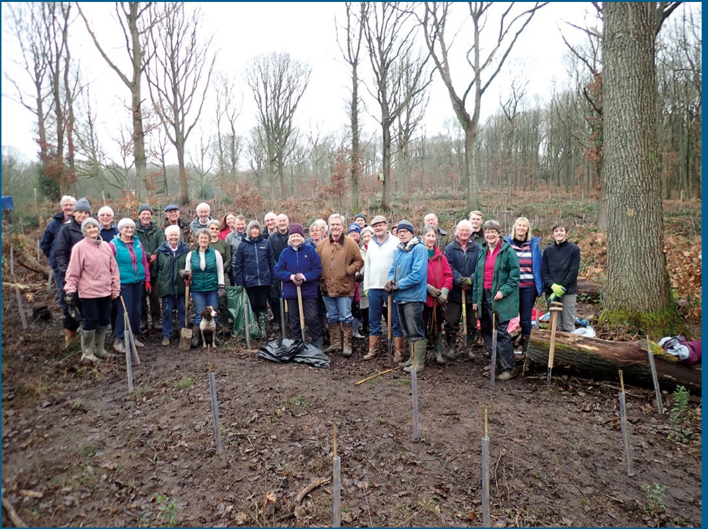
Volunteers and MP Mark Garnier planting over 2,000 trees on Ruskin Land in January 2020.