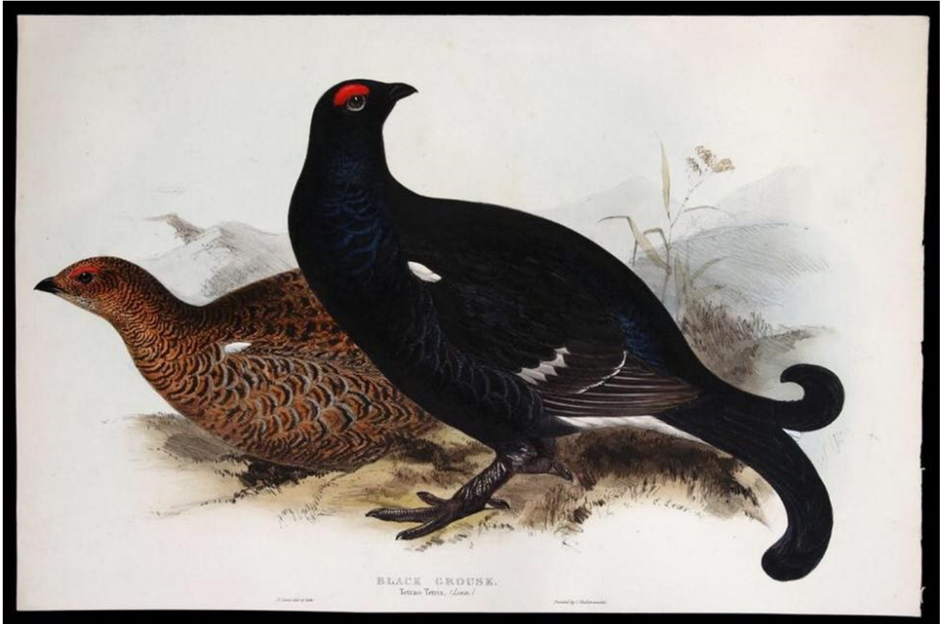
Edward Lear, "Black Grouse" [ Tetrao tetrix ] (1832-37). http://www.guildofstgeorge.org.uk/the-collection/