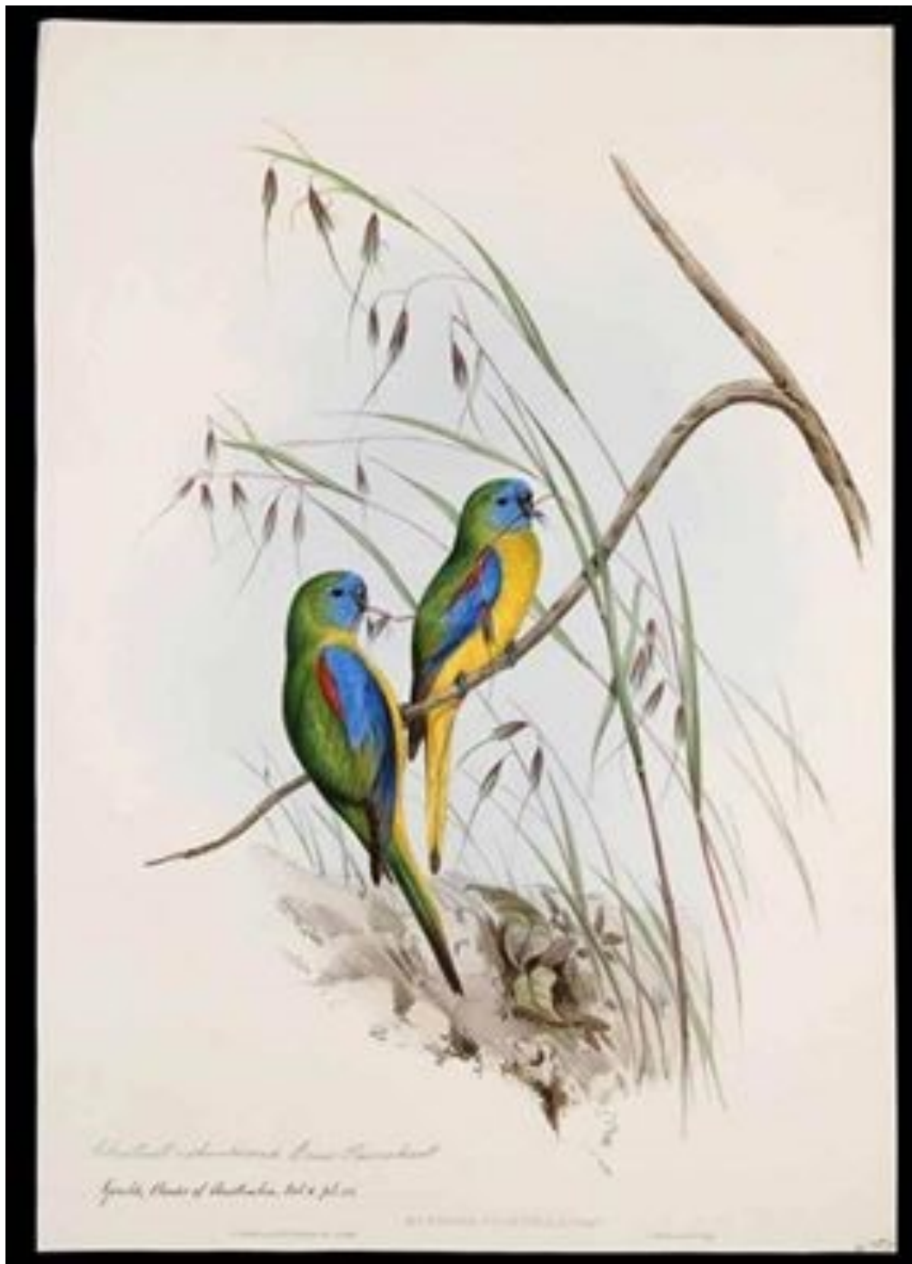
Turquoise parrot [ Euphema pulchella ] (1840-48) after John Gould. http://www.guildofstgeorge.org.uk/the-collection/