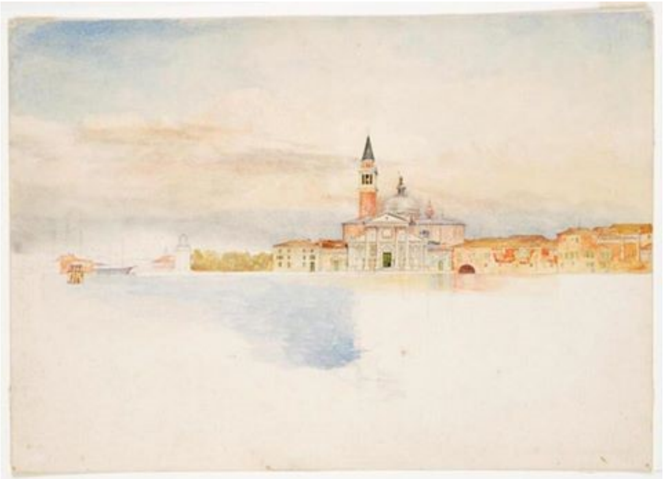
Henry Roderick Newman, "View of the Island of San Giorgio across the Basin of San Marco, Venice, Italy" (1881).

http://www.guildofstgeorge.org.uk/the-collection/