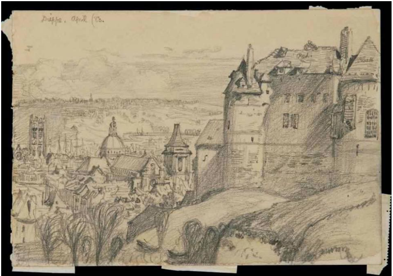
William Hackstoun: View of the Town from the Cathedral, Dieppe, France (1883) guildofstgeorge.org.uk/the-collection/