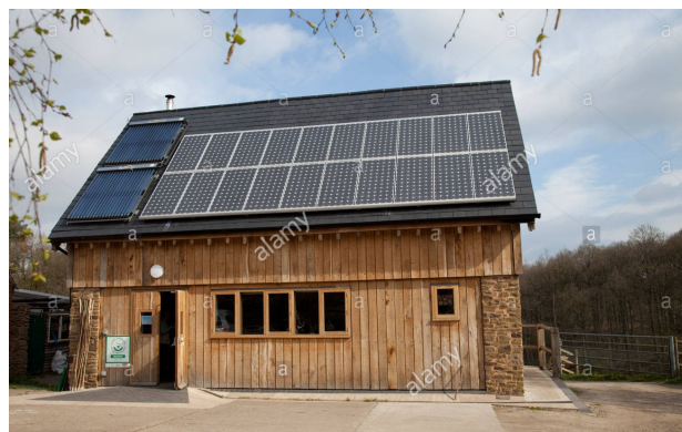
(Above) The Ruskin Studio at Unclyys Farm, Ruskin Land.