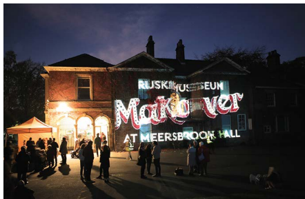
Ruskin Museums Makeover week at Meersbrook Hall, Sheffield 2018.