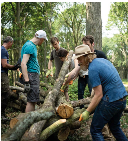
Studio in the Woods at Ruskin Land.