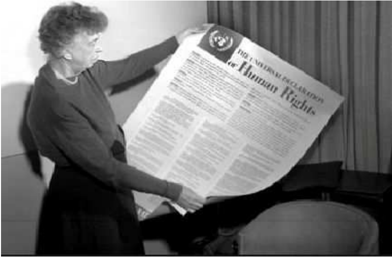
Eleanor Roosevelt holding The Universal Declaration of Human Rights

and the concomitant corruption that he deplored. Though himself born to wealth, he like the Roosevelts, well knew that necessitous men can never be free, and that their need must be lifted in order for them to be so — everywhere in the world.