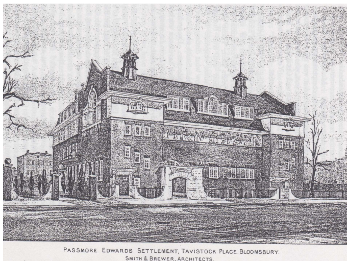
Architects' drawing of Passmore Edwards Settlement (now Mary Ward House) London Metropolitan Archives

contribution to its construction and was present for the dedication indicates she was sympathetic to its ends. 16